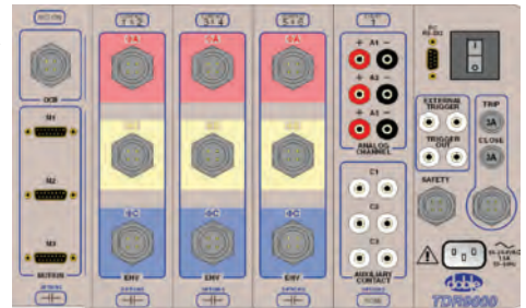
Figure 5. Circuit Breaker with 3 Motion Channels

OCB EHV EHV EHV 3A + 3X System Module + 3 motion