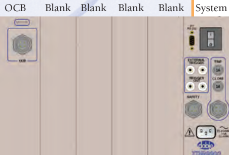
Figure 2. Minimum Configuration for Circuit Breakers

TDR9000 can be delivered with only the required modules and can be upgraded at a future date to accommodate the changing needs of the user. The following figures indicate some of the valid configurations to the TDR9000 instrument.