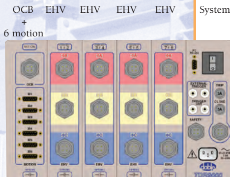
Figure 4. Circuit Breaker Configuration with 6 Motion Channels

Figure 4 is the configuration for testing Circuit Breakers (one break per phase) and EHV breakers; measuring two breaks per phase for each EHV module. Four EHV modules are used for testing eight breaks per phase for 24 total breaks. Insertion resistor and value measurement timing is also included. Insertion resistor value measurement is optional.